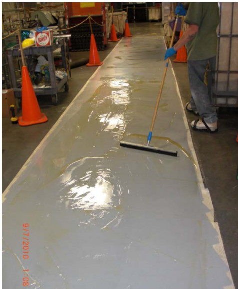
BIO-FLOR 182 being applied by squeegee

Once the gray BIO-GARD 488 primer dried, it was time to apply the body coat of clear BIO-FLOR 182, a solvent-free pure epoxy resin used to bind the color chips and give a gentle texture to the floor.