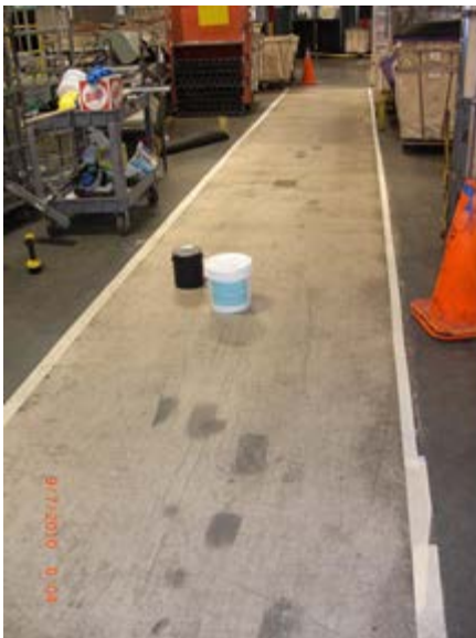
The VAT application surface after stripping

Introduced by TFT about 10 years ago, BIO-FLOR 182 was then a giant step forward since it allowed complete installation of a three coat system with unrestricted use in 24 hours. TFT has since been challenged to reduce this time to 12 hours while retaining excellent performance over a variety of surfaces including vinyl composite tile (VCT), vinyl asbestos tile (VAT), and concrete.