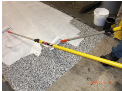
Application of the final BIO-GARD 488 Glaze

Immediately after rolling was completed, the multi-colored ¼” chip mixture was broadcast by hand in a “chicken-feeding” manner. After broadcasting all the color chips, the entire surface was re-rolled to even out the chip distribution. This surface was then left for about 4 hours after which time it was cured sufficiently to allow access with spiked shoes.