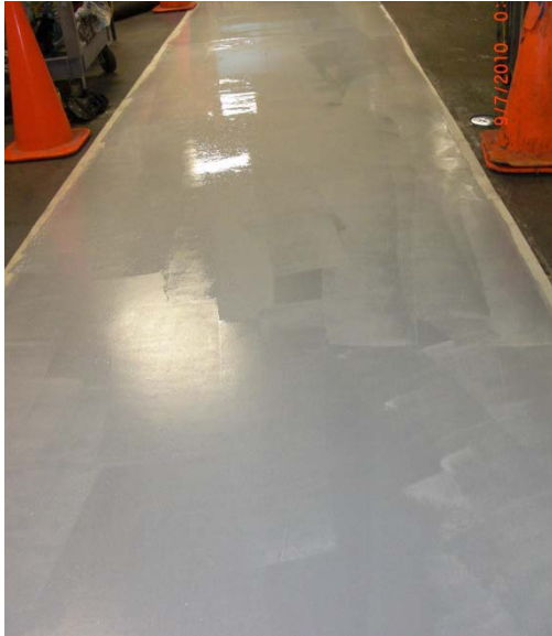
BIO-GARD 488 drying – note color and gloss change

Once the gray BIO-GARD 488 primer dried, it was time to apply the body coat of clear BIO-FLOR 182, a solvent-free pure epoxy resin used to bind the color chips and give a gentle texture to the floor.