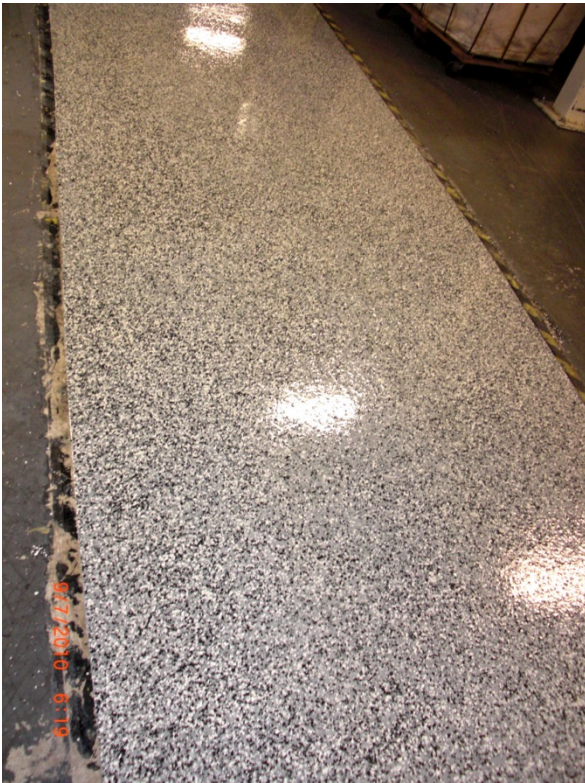
Final Result – hard, glossy and clear

RESULT: TFT's new Hybrid Quick-Cure Flooring System met all the client's criteria for fast curing and high performance with minimal business disruption. It was installed and ready for foot traffic in approximately 7 hours. Not only that, but future maintenance will be far simpler and less expensive than maintaining the VAT it replaced. As a bonus, its cosmetic appearance is also far superior to the previous VAT flooring.